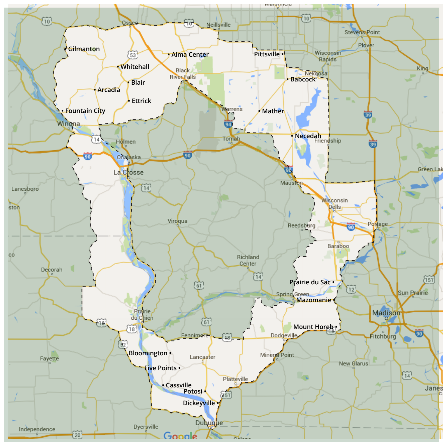
The EXTRA RATE EXTENDED SERVICE AREA crosses the Mississippi River into southeastern Minnesota and northeastern Iowa, as shown on the map. In Wisconsin, the northern limit is defined by highways 10, 73, 54, and 82; the eastern limit by I-39 and highway 78, and the southern limit by highways 151, 18, 78, and 14 (from west to east). At the extreme limits, this area includes Winona, Osseo, Neillsville, Pittsville, Wisconsin Dells, Portage, Prairie du Sac, Mazomanie, Mount Horeb, Dodgeville, Platteville, and Dickeyville. We generally do not service the city of Dubuque, but use the highway to cross into northeastern Iowa to service the rural cemeteries northwest of Dubuque.